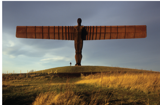
Antony Gormley Angel of the North sculpture

The enormous sculpture by Antony Gormley reflects the history of the North East of England and its people. Your local area could make an interesting starting point for your ideas.