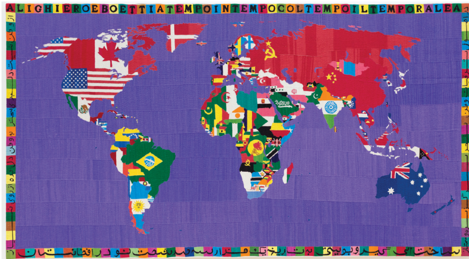
Alighiero Boetti Mappa, 1990 embroidery on linen

Flags and banners are sometimes used as symbols of power. Alighiero Boetti created this textile map of the world using pieces of cloth from the flag of each nation.