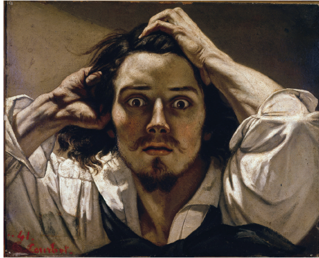
Gustave Courbet The Desperate Man (Self Portrait) painting

The artist Gustave Courbet has painted himself with his eyes wide open, to emphasise the intensity of his feelings. Powerful emotions such as extreme sadness or joy could provide you with ideas.