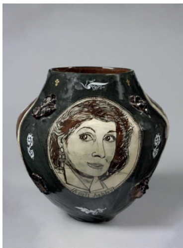
Grayson Perry My Heroes ceramic

A hero can be a powerful inspiration. It could be a famous person, or perhaps someone you know personally. Grayson Perry portrays his own heroes on this hand built ceramic vase.