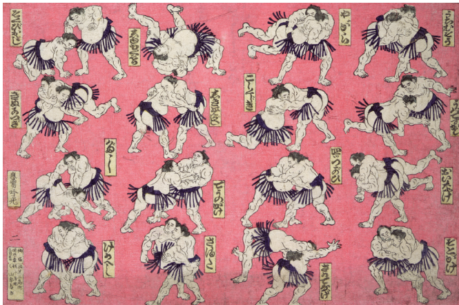
Japanese School Sumo wrestlers hand tinted wood engraving on paper

Physical and mental power is needed when participating in many sports. The sumo wrestlers in the wood engraving below make different shapes as they battle to win.