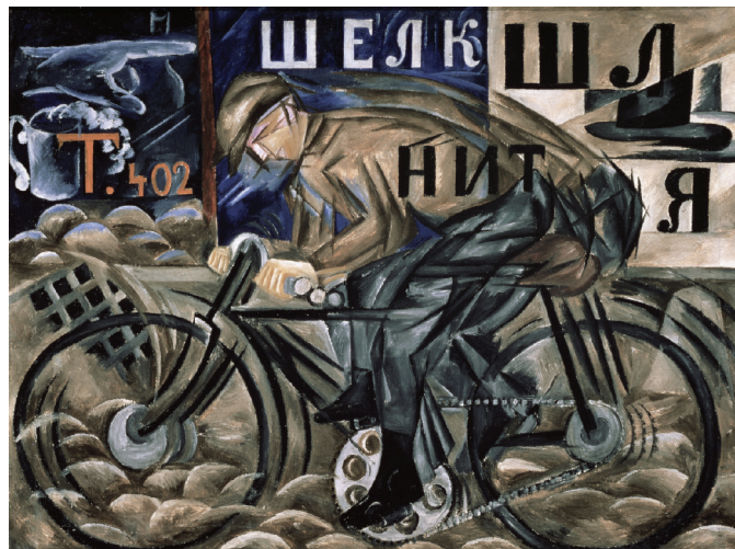
Natalia Goncharova The Cyclist painting

Many forms of transport take us from place to place at speed. Natalia Goncharova shows us a hunched, streamlined cyclist pedalling with force.