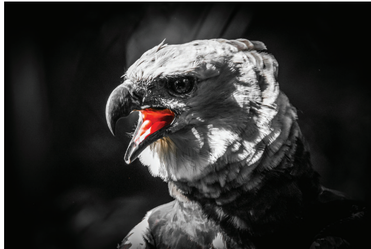
Urs Hauenstein Harpy Eagle photograph

Some animals and birds demonstrate their power when catching prey. In this photograph by Urs Hauenstein the vibrant red draws our attention to the sharp hooked beak.