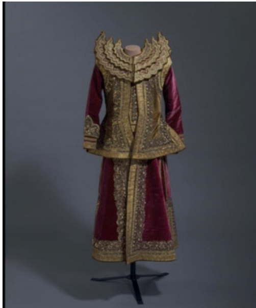
Court Robe c1878–85 (made)

Clothing is often worn as a symbol of power, wealth and/or status. This ceremonial military costume has a cloud collar, which frames the wearer's face and creates a sense of importance.