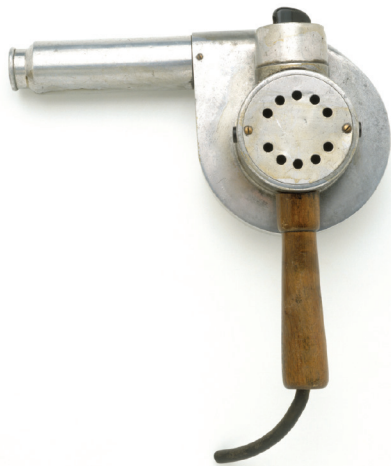
Electric hairdryer, 1925 product design

Everyday items for the home require power. The design of this 1925 hairdryer uses simple strong geometric shapes. In Wayne Thiebaud's drawing the long flex appears to emphasise the importance of the power source.