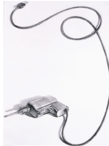
Wayne Thiebaud Power Drill drawing

Many forms of transport take us from place to place at speed. Natalia Goncharova shows us a hunched, streamlined cyclist pedalling with force.