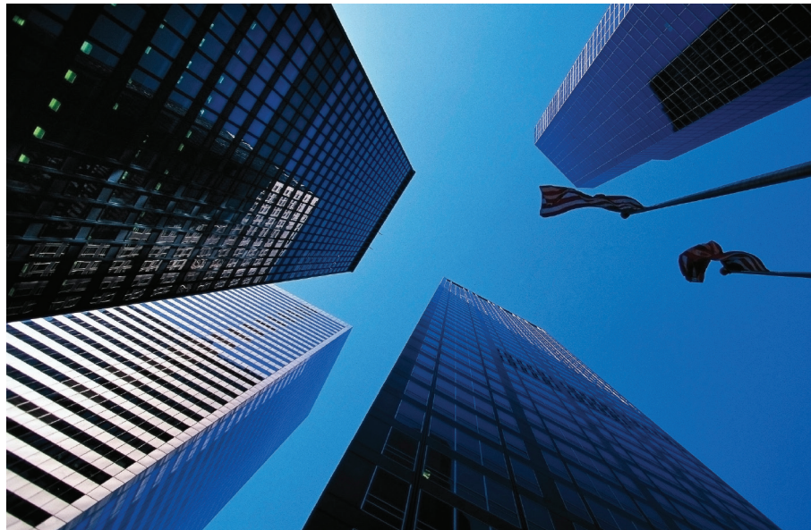
Skyscrapers, Whitehall Street, Financial District, Lower Manhattan, New York, United States photograph

Here are some other suggestions that may stimulate your ideas: