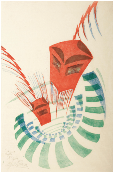
Cyril Power Lifts linocut

A powerful telephoto or macro lens allows us to capture the environment from unusual perspectives as shown in the photograph of skyscrapers.