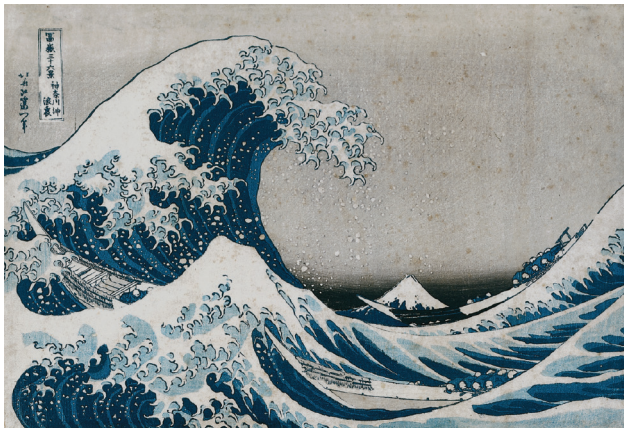
Katsushika Hokusai The Great Wave off Kanagawa woodblock print