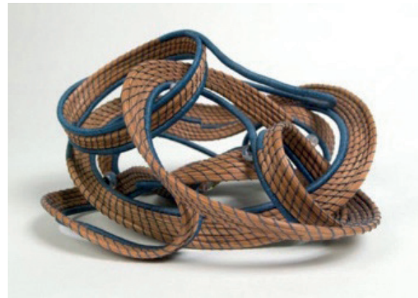
Nadine Spier Whirlwind textile design

Extreme weather conditions have an impact on how plants grow. Some plants grow tall and straight and others twist and distort.